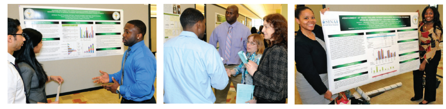
May 3: Fourth-year student pharmacists presented the findings of their year-long research projects at the College of Pharmacy's second annual Capstone Research Day.