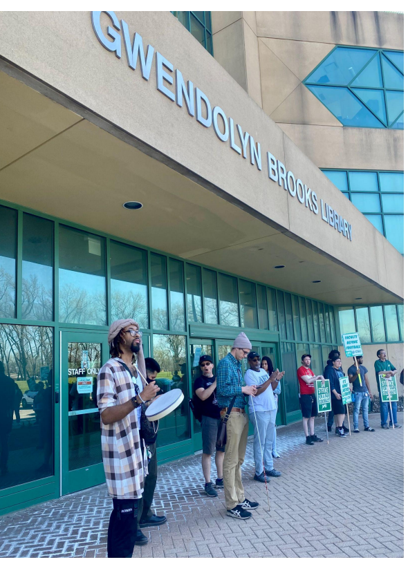
CSU faculty and friends rally outside the <u>Gwendolyn</u> <u>Brooks Library (GBL)</u> during a 10-day faculty strike (<u>UPI Local 4100</u>), April, 2023.