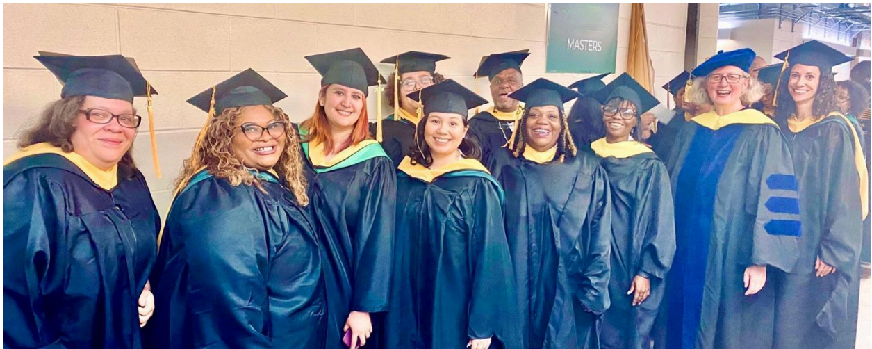
MSLIS students preparing for the commencement ceremony at the CSU Jones Convocation Center, May 9th, 2024