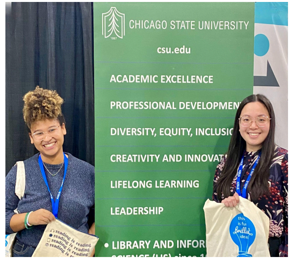
CSU MSLIS student volunteers at the AISLE Conference 📖RAM