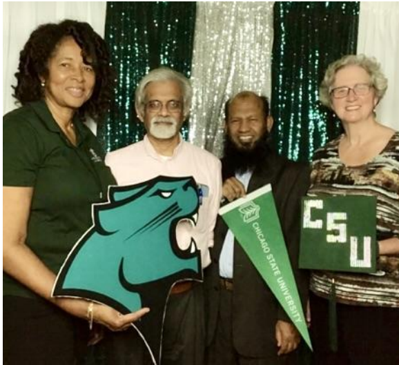
CIMST staff and faculty gather at the CSU Graduate School Open House